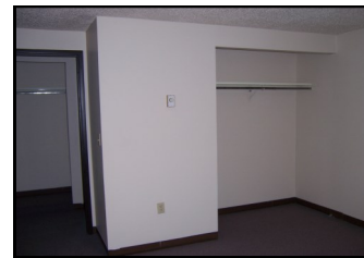
Skylight in the master