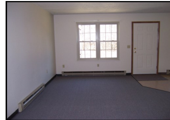
Updated windows that tilt in for easy cleaning.