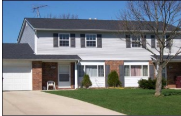
Scranton Woods 38 2, 3, & 4 Bed- room Units Newbury Schools Newbury