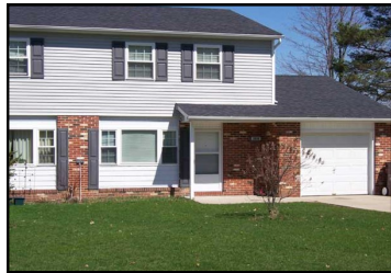
Cloverdale Estates 49 2 & 3 Bed- room Units Cardinal Schools Middlefield