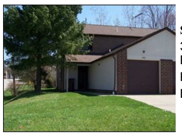
Strickland Arms 30 2 & 3 Bedroom Units Kenston Schools Bainbridge