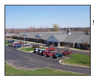
Murray Manor 76 Single Bedroom Units Chardon Schools Chardon