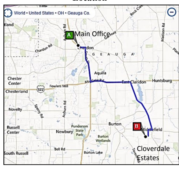
Housing Choice Voucher Program

GMHA also administers the Section 8 Housing Choice Voucher rental assistance. Through this program, GMHA can assist up to 171 qualified low-income families with their rent and utility costs. Housing is obtained through privately owned properties. GMHA maintains a separate waiting list of applicants seeking the Section 8 HCV program assistance.