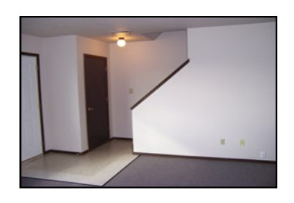
Enjoy an open floor plan