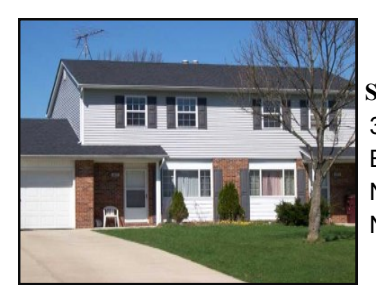
Scranton Woods 38 2, 3, & 4 Bedroom Units Newbury Schools Newbury