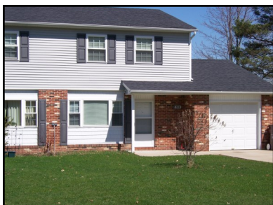
Cloverdale Estates 49 2 & 3 Bed- room Units Cardinal Schools Middlefield