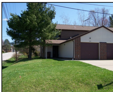
Strickland Arms 30 2 & 3 Bed- room Units Kenston Schools Bainbridge