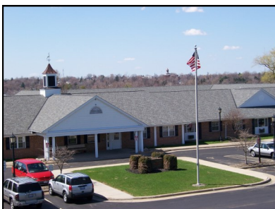
Murray Manor 76 Single Bed- room Units Chardon Schools Chardon