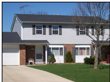
Scranton Woods 38 2, 3 & 4 Bed- room Units Newbury Schools Newbury