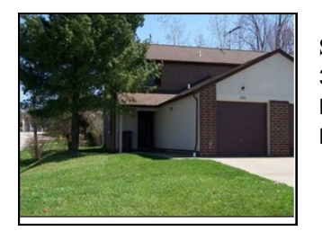
Strickland Arms 30 Family Units Kenston Schools Bainbridge