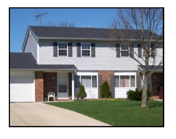
Scranton Woods 38 family Units Newbury Schools Newbury