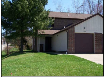
Strickland Arms 302 & 3 Bedroom Units Kenston Schools Bainbridge