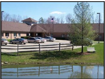
Harris House 50 Single Bedroom Units Chardon Schools Chardon