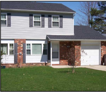
Cloverdale Estates 49 2, 3, & 4 Bedroom Units Cardinal Schools Middlefield