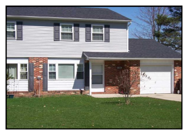
Cloverdale Estates 49 2 & 3 Bedroom Units Cardinal Schools Middlefield