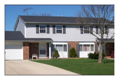
Scranton Woods 38 2, 3, & 4 Bedroom Units Newbury Schools Newbury